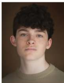
HAYDN COURT X arise